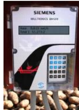
Digital Read-out (Displayed in cwt. or tons)