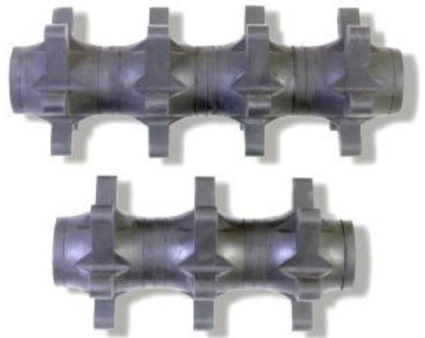
MILESTONE SIZING STAR ROLLER Patented

The Milestone Star Sizing Roller Patented and Dirt Eliminator Roller Patented have combined the accuracy of other rollers with the aggressiveness of the traditional star roll to create a roller that is more accurate and consistent while keeping the product flowing quickly. The Milestone Star Rollers are molded from low durometer rubber to be gentle on your potatoes while providing UV inhibitors to give you many years of trouble-free accurate sizing and dirt elimination.