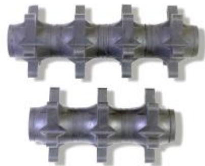
Dirt Eliminator Sizer Sorter Model MSDSE