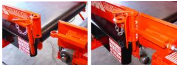
E-Z Connect Conveyor Coupling System