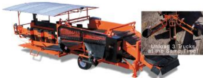
Dirt Eliminator Sizer Sorter Model 2084E