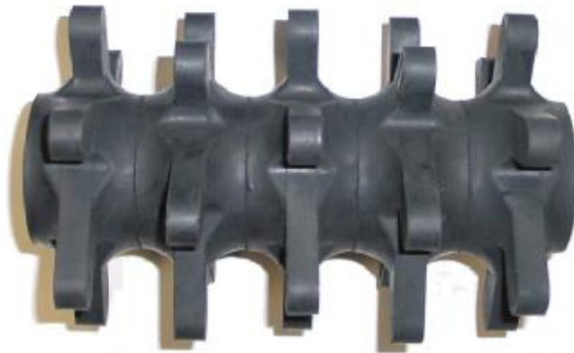
MILESTONE DIRT ELIMINATOR ROLLER Patented